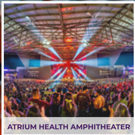
ATRIUM HEALTH AMPHITHEATER