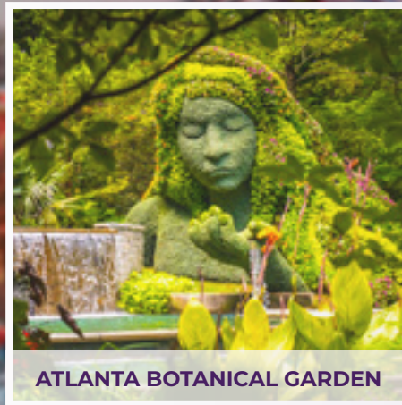
ATLANTA BOTANICAL GARDEN