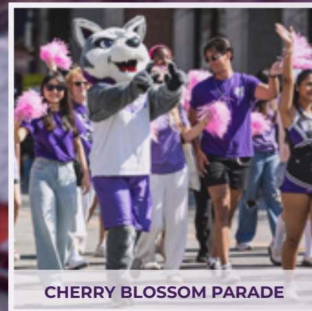
CHERRY BLOSSOM PARADE

Macon is less than a 90-minute drive from the world's busiest international airport and 16 Fortune 500 head offices in Atlanta, offering prime career connections, and easy flights across the U.S. and anywhere in the world!