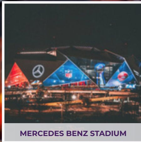
MERCEDES BENZ STADIUM