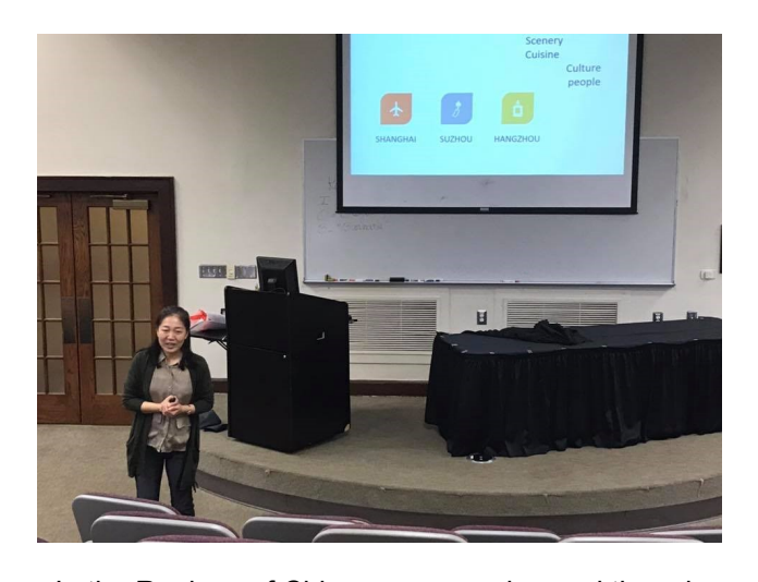
In the Regions of China course we learned there is more to China than Shanghai and Beijing.