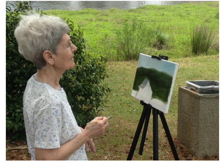
Last semester student considers her brushstrokes in one of WALL's Art and Design Classes