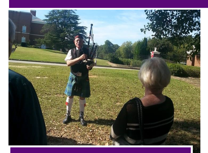
Music can usually be heard during a WALL semester. These students learn about the Highland Bagpipe in a previous course

Wesleyan College offers so much to our WALL members and to the community at large. Many events on campus are open to the public (most are free of charge).