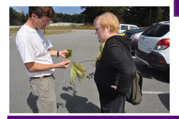
Wall Member gets information on fauna during a Tree and Shrubbery class last spring.