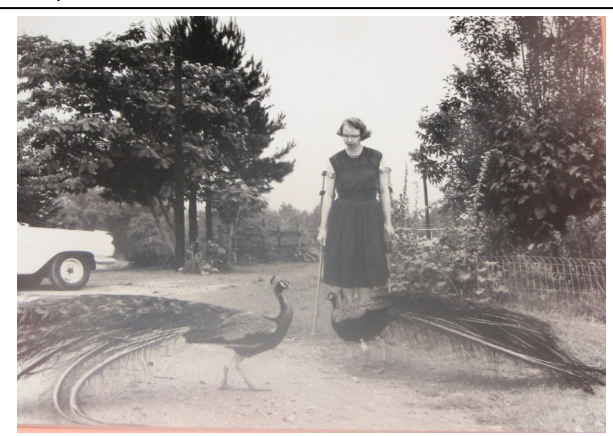
Wall members learned more about legendary author Flannery O'Connor in a September study of her short stories