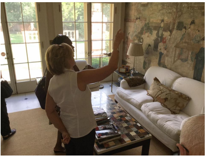
From Tai Chi to Classic Macon Architecture, Wall Members explore all kinds of interesting topics in September. October looks just as good!