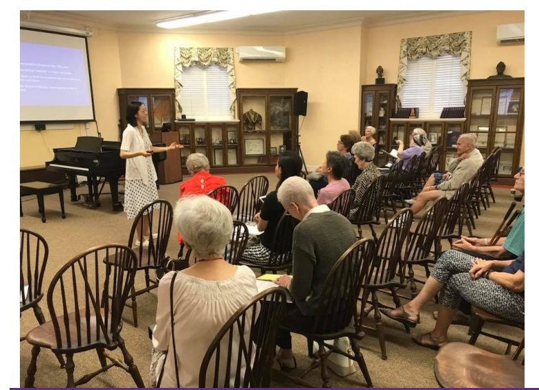
Students dive into Modern Classical Music during this new offering for the Fall Semester.