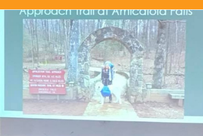
Wall Members Learn about hiking the Appalachian Trail.