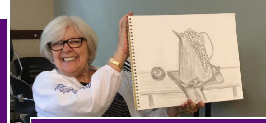
Students focus on their drawing talents in this artistic class.