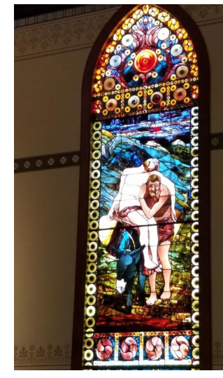
Christ Chapel in downtown Macon is an example of Religious Art and Architecture

Don't forget that Wesleyan art galleries are open Monday-Friday from 1:30 - 5:00 PM and the Wesleyan Market is every Saturday from 10:00 AM – 2:00 PM