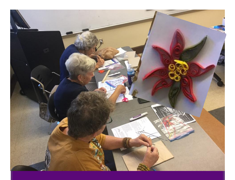
Paper transformed into art. Members learn to quill.