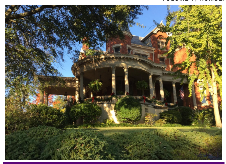
Macon's Hay House in Defining Classic Architecture

Wesleyan College offers so much to our WALL members and to the community at large. Many events on campus are open to the public (most are free of charge).