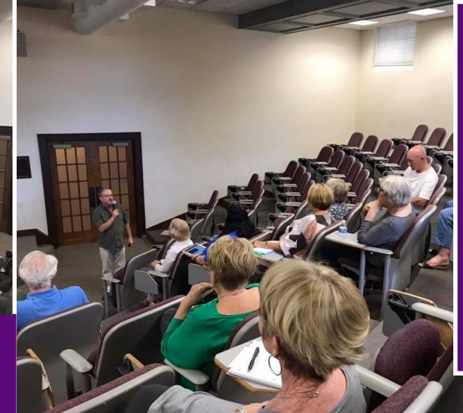
Students explore how our brains affect human behavior