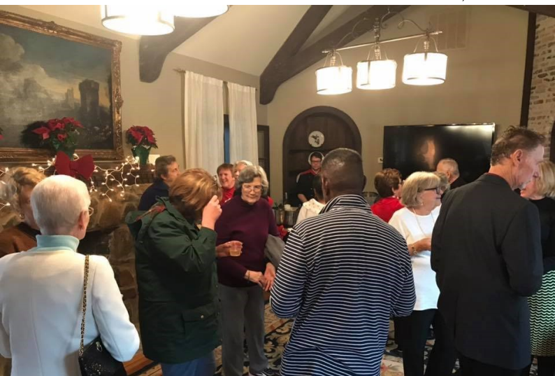
WALL members enjoy a Christmas get together