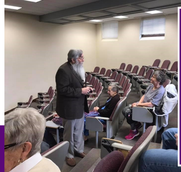
An exploration of early Georgia History was a popular January class