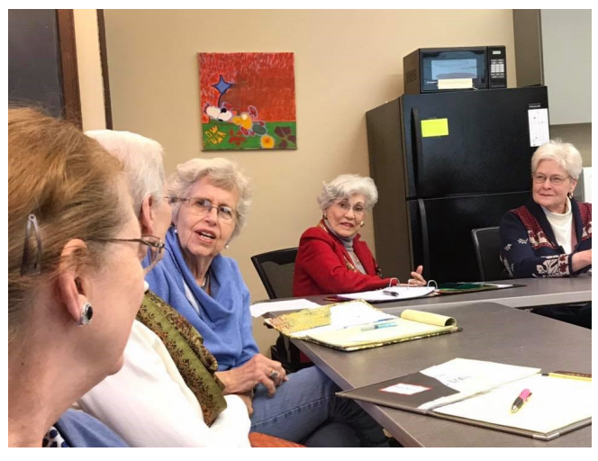
A discussion of the opera Carmen in preparation for this month's performance at the Douglas Theatre

Don't forget that Wesleyan art galleries are open Monday-Friday from 1:30 - 5:00 PM and the Wesleyan Market is every 2nd Saturday from 10:00 AM – 2:00 PM