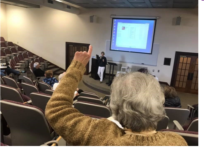
American Musical Theatre Class in the Taylor Amphitheatre

Wesleyan College offers so much to our WALL members and to the community at large. Many events on campus are open to the public (most are free of charge).