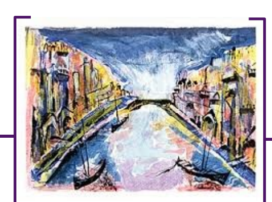
Memories of My Visit to Venice, (1986), Steffen Thomas Museum of Art, Permanent Collection