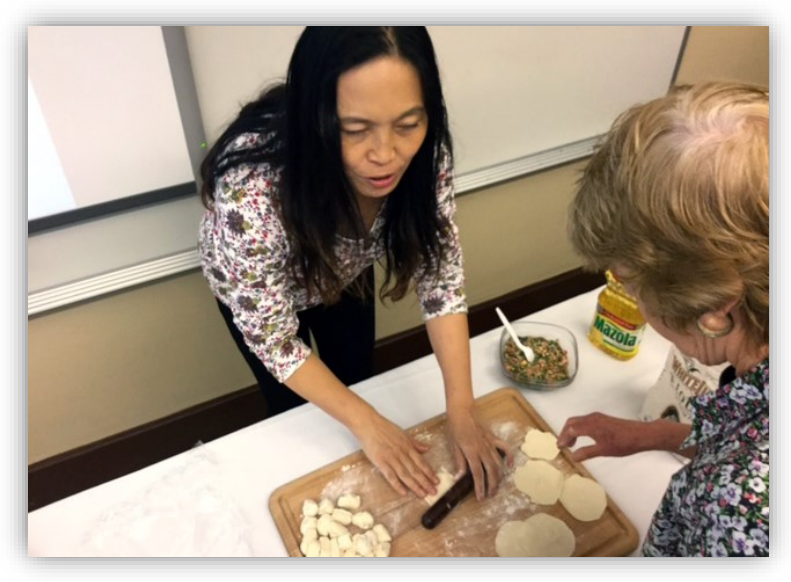
Chinese Cooking Class

From art and science; cooking and learning more about our natural environment. WALL members got busy during the Winter/Spring Semester.