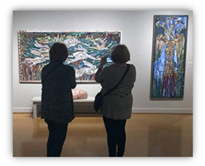
Artistic Field Trip