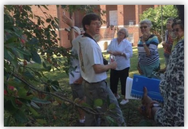
Plants and Shrubs